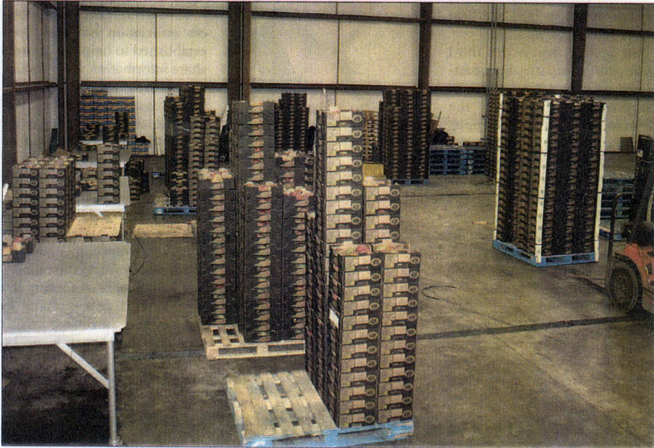
The new and currently functioning 6,400-square-foot repacking and restyling room at Bifulco's Four Seasons Cold Storage. It features USDA-approved light fixtures with a 55-foot candle level for better product visibility. It is also conveniently connected to a 3,000-square-foot supply room.

And will get there without breaking the cold chain.